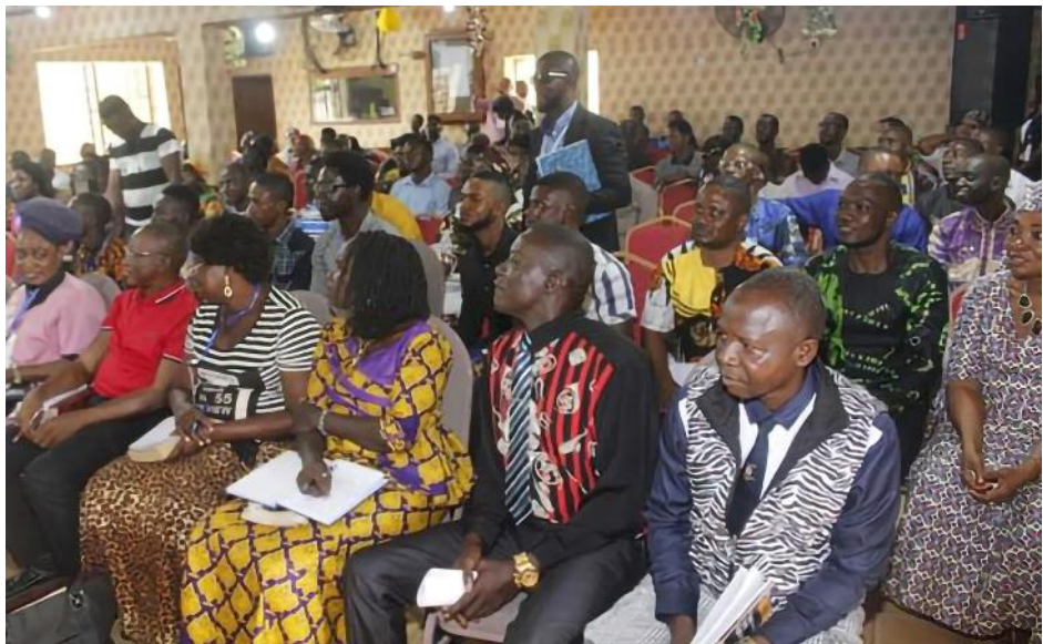
Church Planting Training seminar for partner churches

Collaboration has been key to our success this year. By partnering with other churches and ministries , we've been able to extend our reach and effectiveness in church planting. These partnerships have allowed us to conduct leadership and discipleship